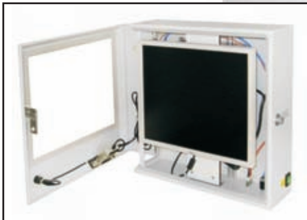
large lockable service door