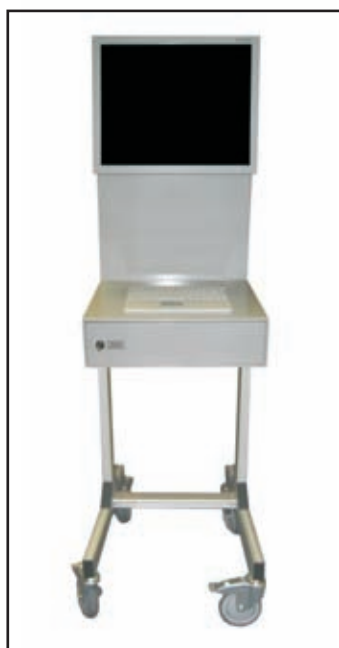
FixMode incl. TFT-Saver as mobile system