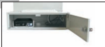
PC is easily accessible